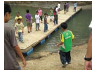
The temporary footbridge going to the school