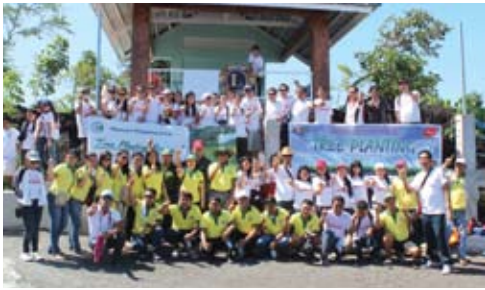
Planting trees at the Malagos Watershed and adopted mangrove area in Davao City, and in San Nicolas, Batangas