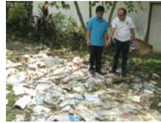
Books of the Matina Pangi Elem. School after the flood

“Today, we are so blessed and lucky that Phoenix came over to our school to donate books. Thank you so much Phoenix for your generosity and concern to us. Even though our school is so far away, you really came. I assure you that we will use all of these books.”