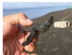
Residents turn over eggs to the PPIP hatchery, where they are incubated. The hatchlings are later released to sea.