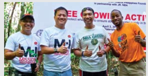
Phoenix events are not only about fun and fitness, they also help the community