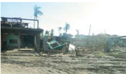
Typhoon Pablo devastated several areas in Compostela Valley and Davao Oriental

Sendong hit Cagayan de Oro and Iligan cities a week before Christmas 2011. We immediately bought P225,000 worth of instant noodles, sardines, and bottled water and transported them to CDO from our main office in Davao City. The relief goods were distributed through the office of the Mayor.