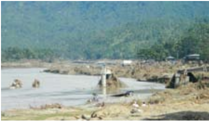
Sendong wrecked riverbanks in Cagayan de Oro and downtown Iligan