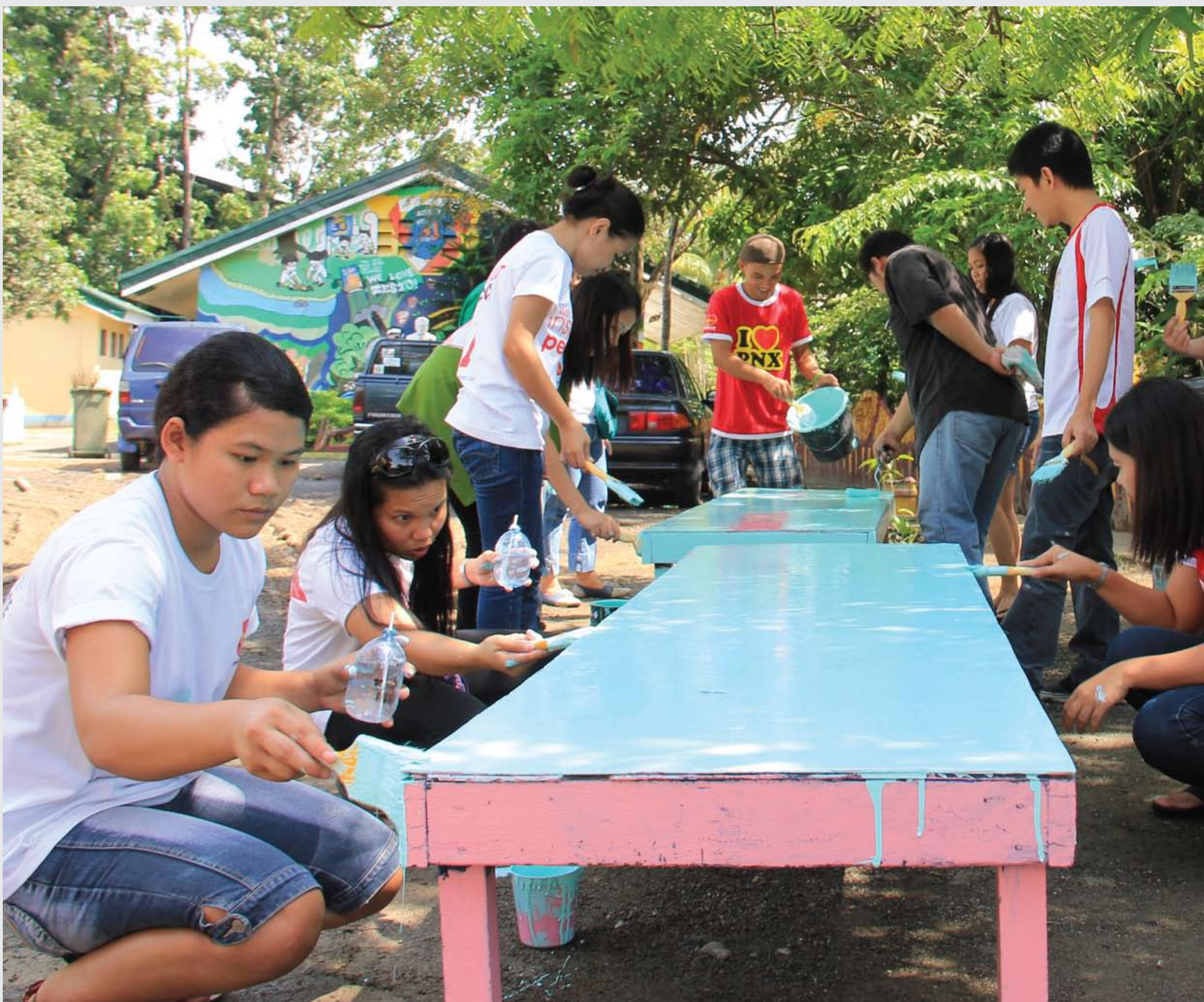
Team Phoenix paints tables and chairs during the annual Brigada Eskwela school improvement program