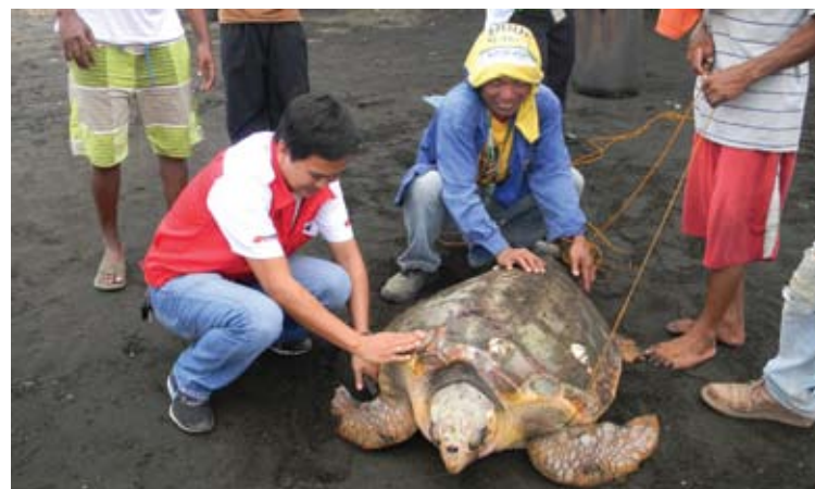
PPIP staff are trained to tag turtles and document their physical characteristics

entangled with their nets or the eggs and hatchlings they find onshore. As an expression of appreciation for their efforts, we reward them with incentives in the form of a half-sack of rice, while PAWB awards these fisherfolk with certificates and caps.