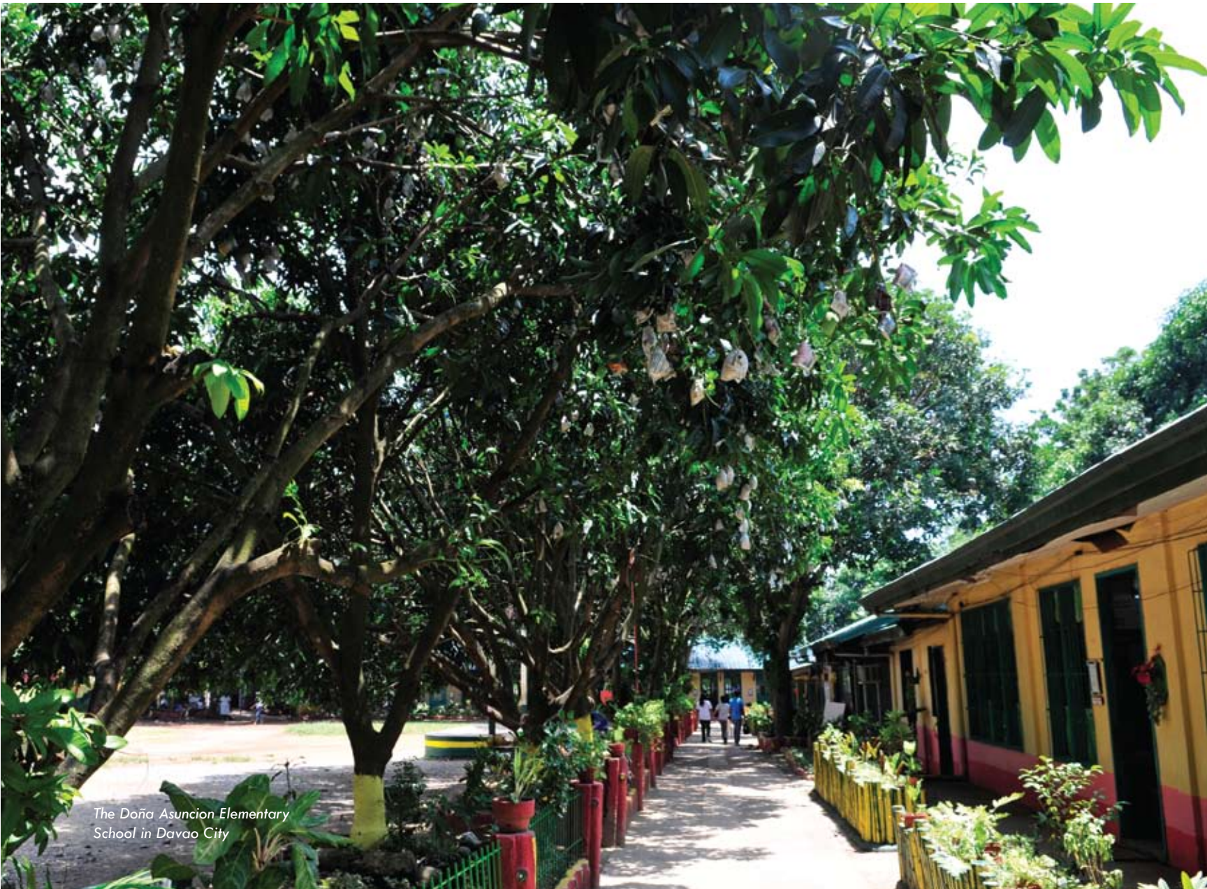
The Doña Asuncion Elementary School in Davao City

Total peso worth of books donated to schools in Mindanao and Visayas