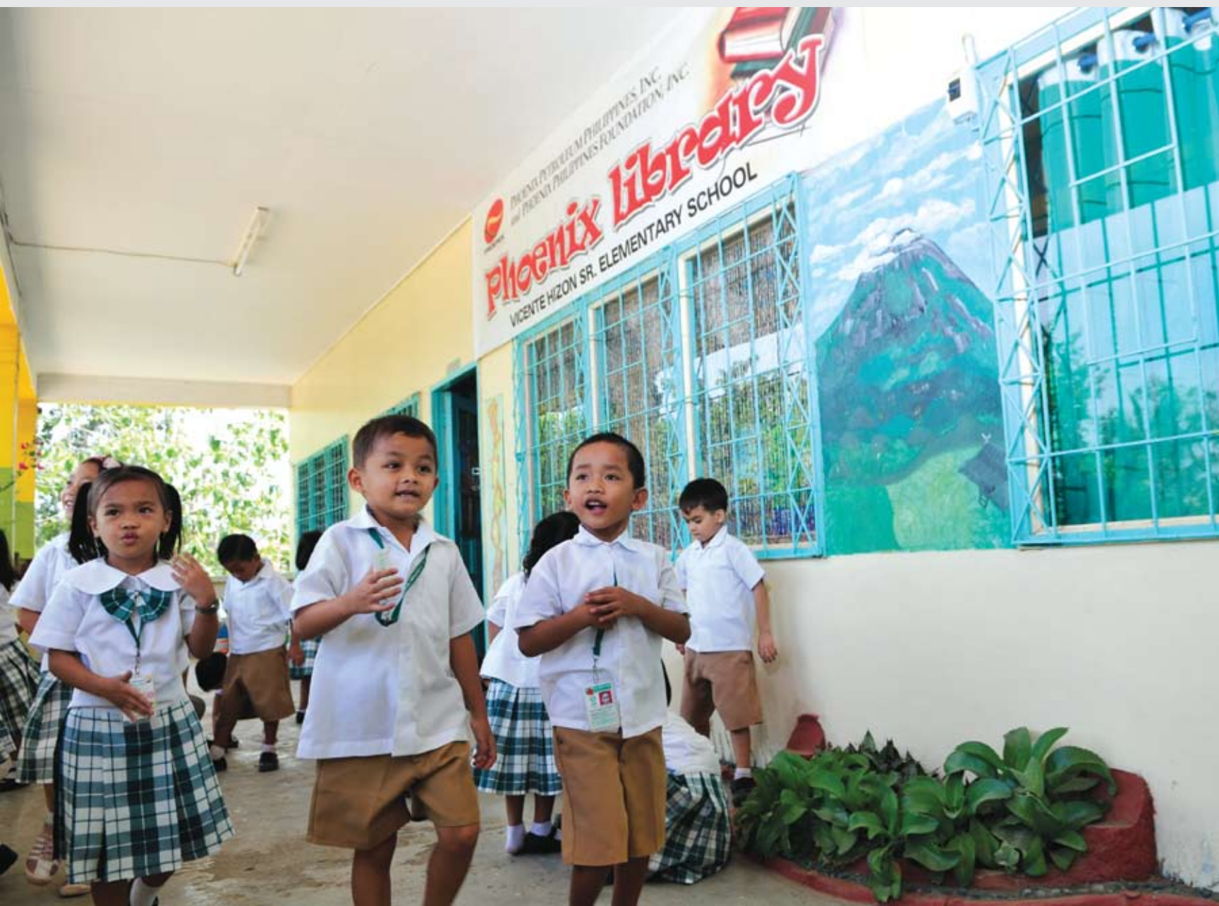
The first Phoenix Library at Vicente Hizon Elementary School, Sasa, Davao City